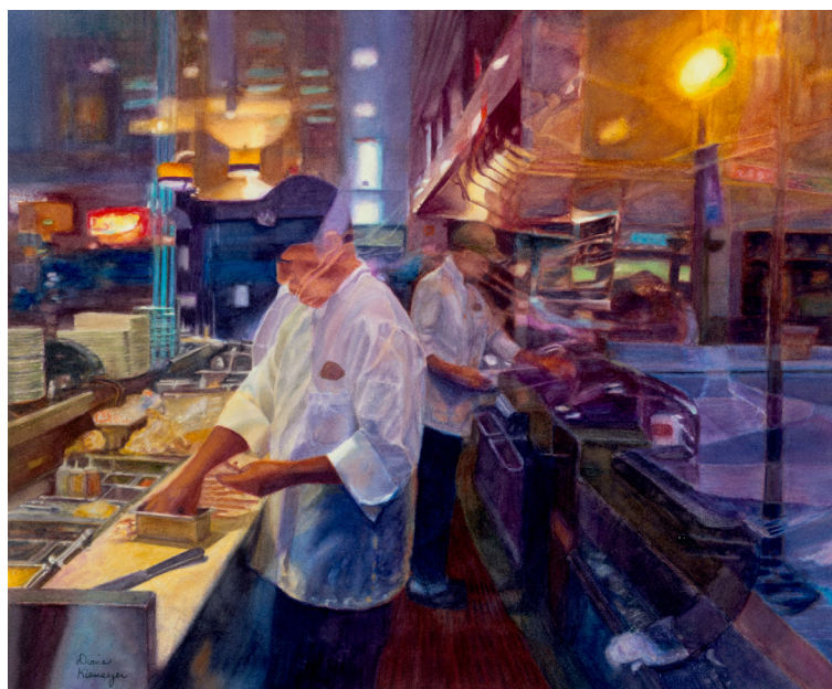
Take Out Time

NWS: The First 100 Years with the Hilbert Museum of California Art