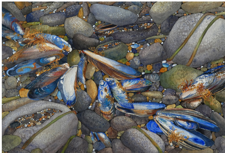
Mendocino Mussels , by Beatrice Trautman NWS: The First 100 Years with the Hilbert Museum of California Art