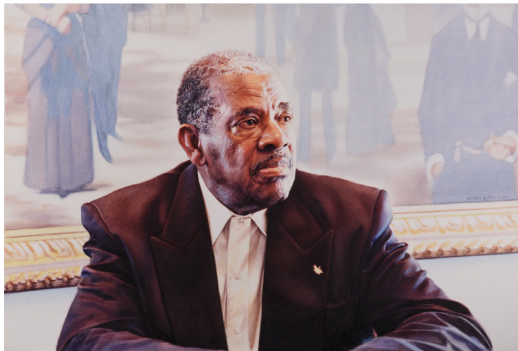
Battle of Angels , by Jeffrey Bass NWS: The First 100 Years with the Hilbert Museum of California Art