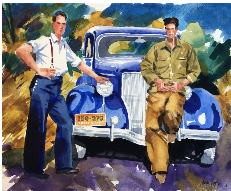
Miles to Go