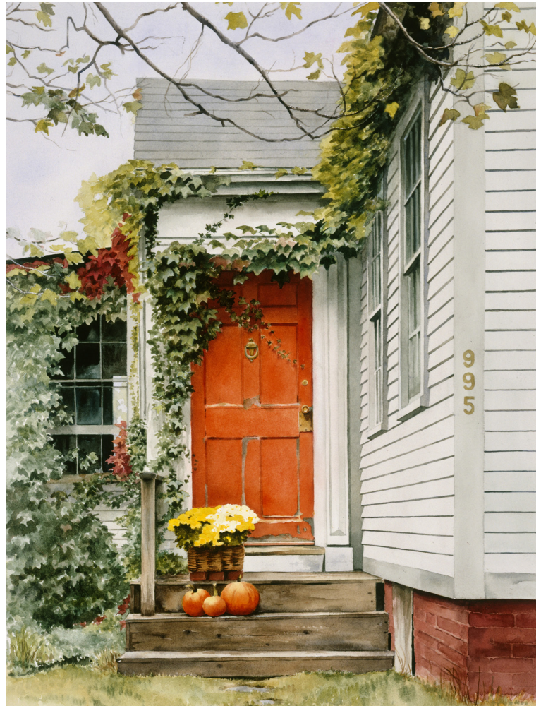
October, Rt 6A NWS: The First 100 Years with the Hilbert Museum of California Art